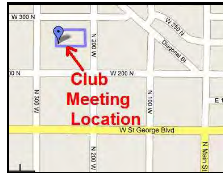
Downtown St. George City (North is up)